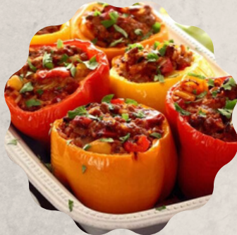
Biber Dolmasi/Polneti Piperki