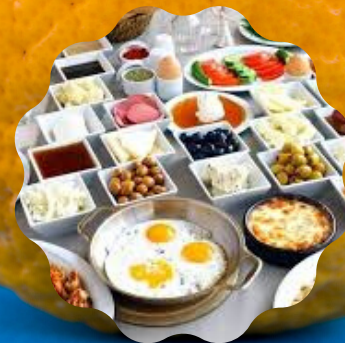
Traditional Turkish Breakfast